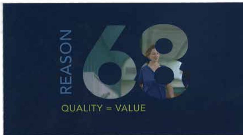
Quality TV Spot - view on youtube: http://bit.ly/29li00n