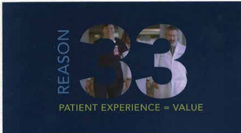
Patient Experience TV Spot - view on youtube: http://bit.ly/29HxW18